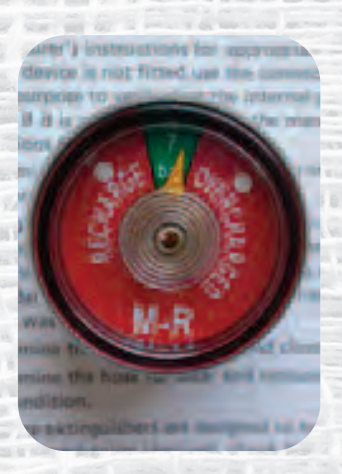
why your extinguishers should be serviced- note this faulty gauge removed yet still shows pressure OK!

Did you know that the cheap equipment that can be bought off the internet may not comply with legislation? All new equipment must be commissioned by a competent technician and must bear a commissioning label with the name of the Company and initials of the Technician,